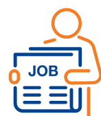
職業拓展日 Career Days