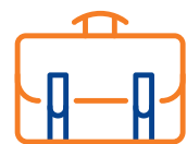
及更多活動 And more...

為加強學生就業能力，新特蘭大學為學生提供創新的就業訓練及支援，學生可透過多方面的資訊及活動，拓展行業人脈網絡，培植領導才能。